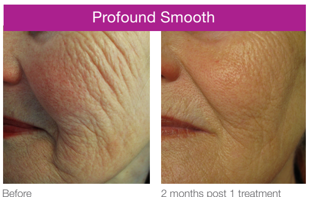
2 months post 1 treatment