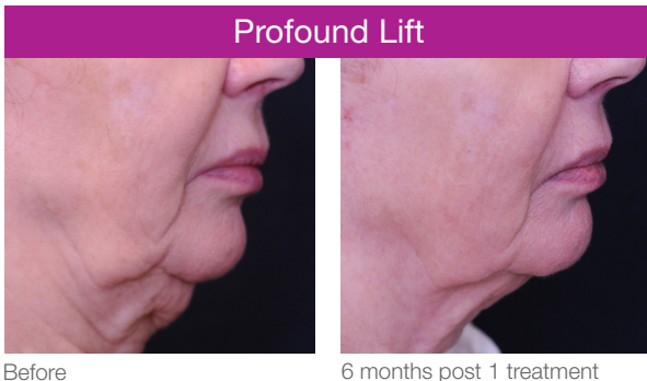
e 6 months post 1 treatment